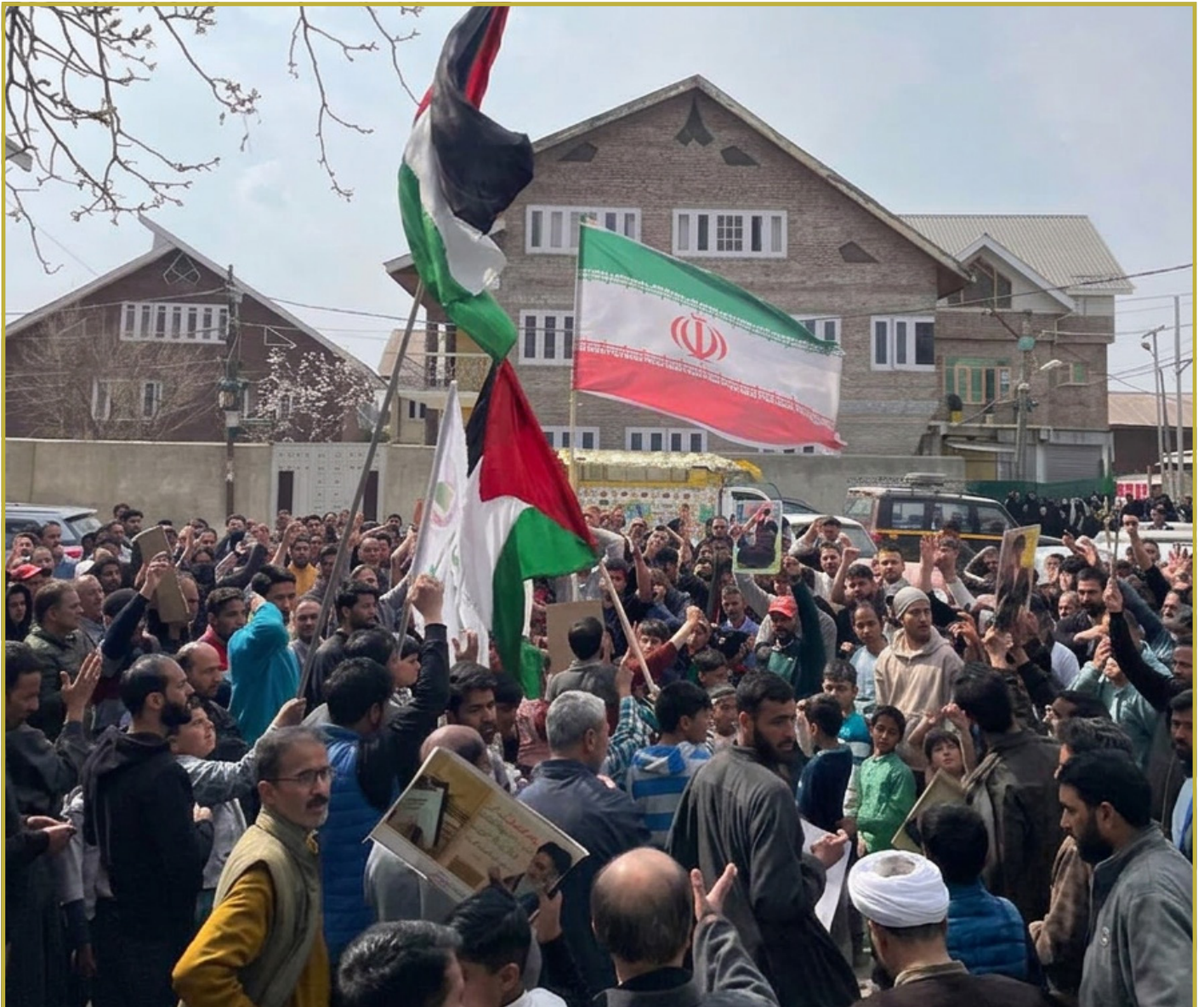
Mourning and solidarity of the Muslim people of Kashmir with Iran following the US-Israeli attack and the martyrdom of Imam Khamenei.