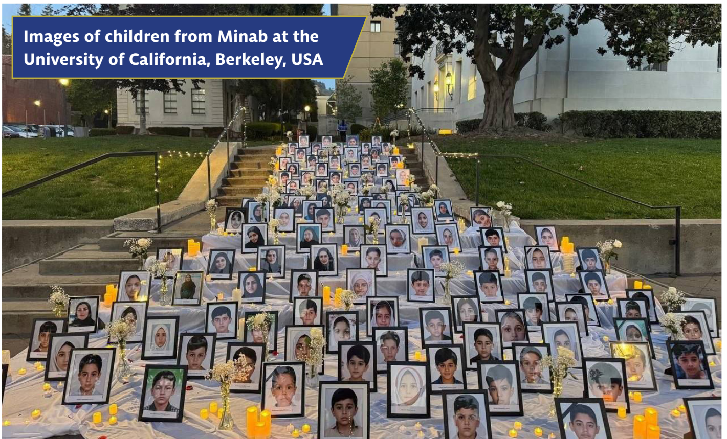
Images of children from Minab at the University of California, Berkeley, USA