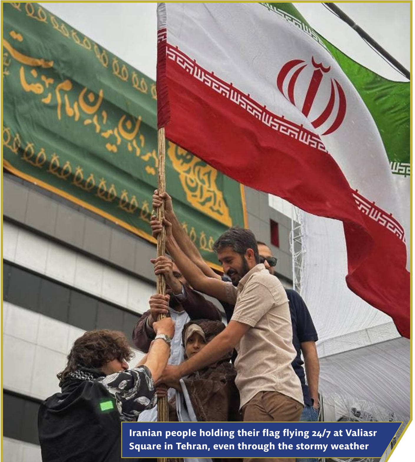
Iranian people holding their flag flying 24/7 at Valiasr Square in Tehran, even through the stormy weather