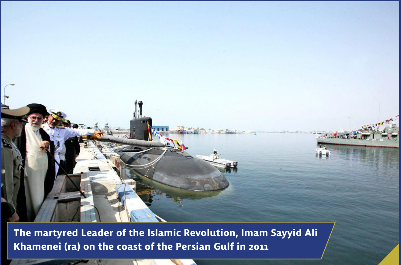
The martyred Leader of the Islamic Revolution, Imam Sayyid Ali Khamenei (ra) on the coast of the Persian Gulf in 2011

He gazes toward the distant blue horizons — this ancient expanse, a perpetual thorn in the throats of tyrants. The Persian Gulf lies still, majestic and serene, as if it had never roared, never swallowed the aggressors whole. But his sharp, penetrating eyes see beyond the surface. He sees the carcasses of pharaohs drifting on the waves. He sees the hand of God dismantling the conspiracies of oppressors.